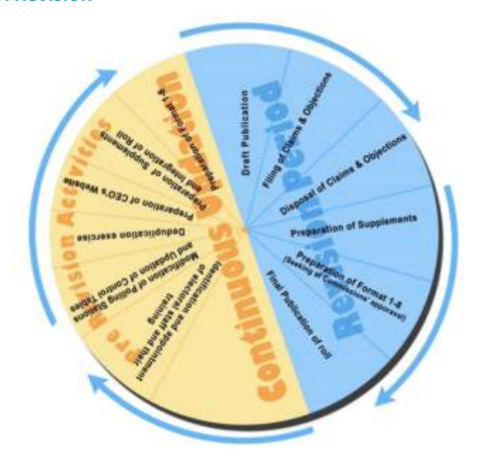
ER Cycle with broad time lines