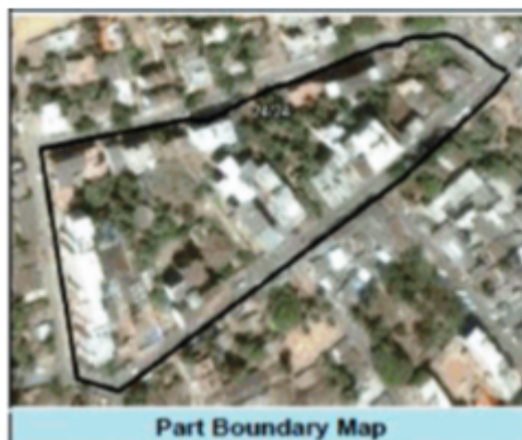
Part Boundary Map