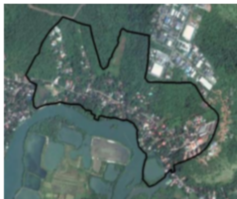
Google Map View