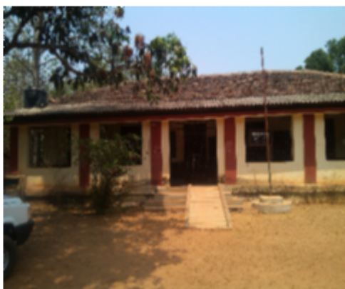
Polling Station Building Front View