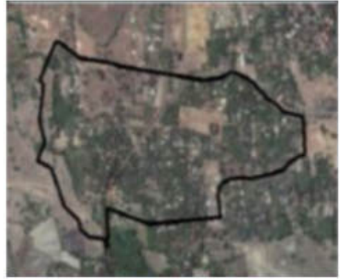
Google Map View