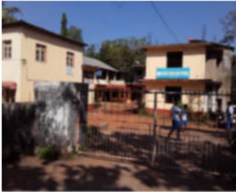
Polling Station Building Front View