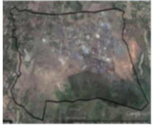
Google Map View