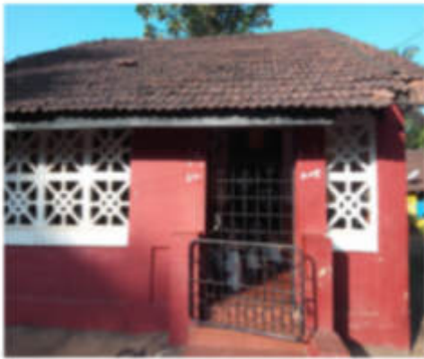
Polling Station Building Front View