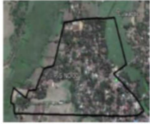
Google Map View