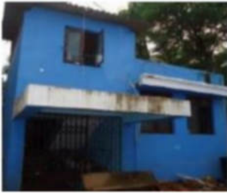
Polling Station Building Front View