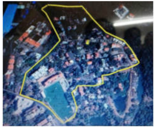
Google Map View