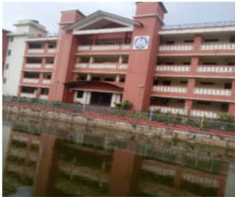
Polling Station Building Front View