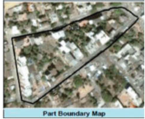
Part Boundary Map