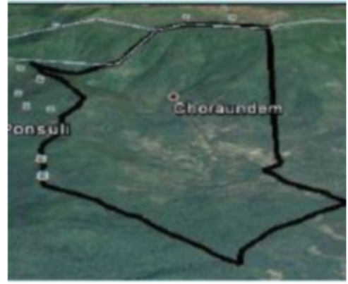
Google Map View