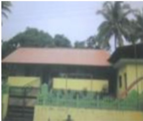
Polling Station Building Front View