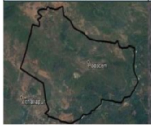
Google Map View