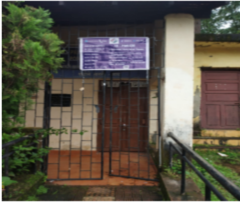
Polling Station Building Front View