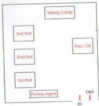
Seating Arrangement at the polling station