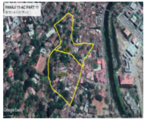
Google Map View