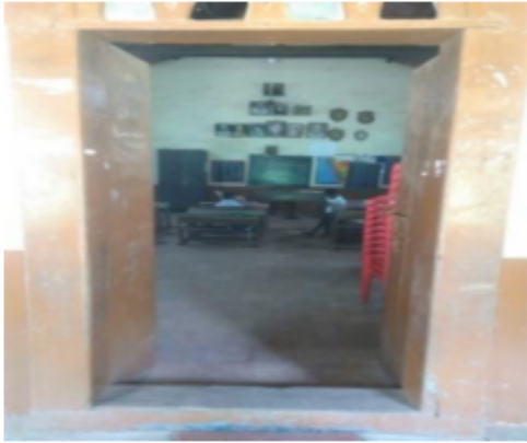
Polling Station Building Front View