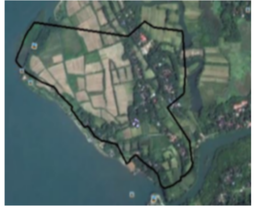
Google Map View