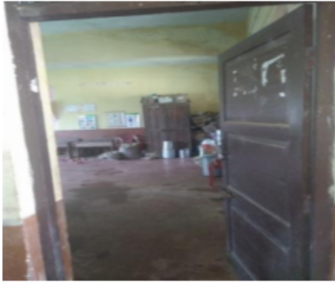
Polling Station Building Front View