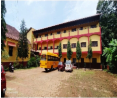
Polling Station Building Front View