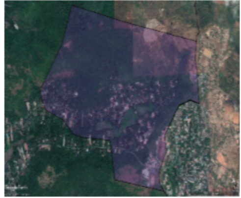
Google Map View