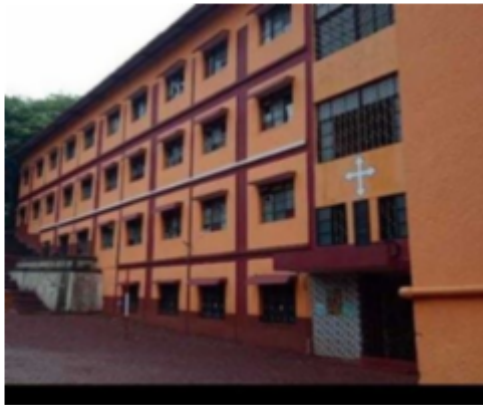
Polling Station Building Front View