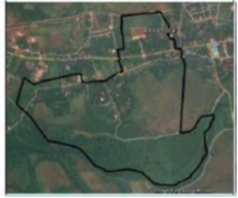
Google Map View