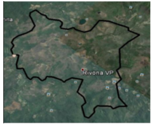
Google Map View