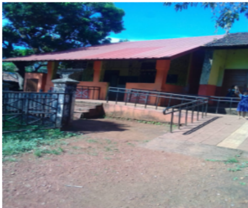
Polling Station Building Front View