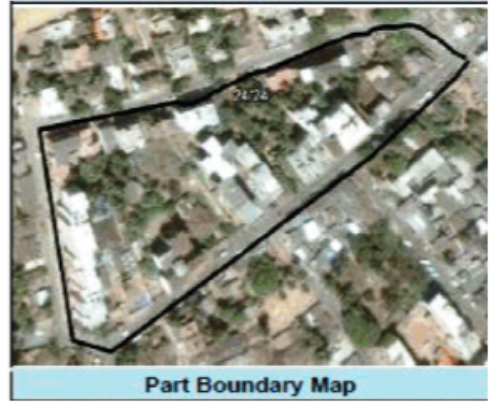
Part Boundary Map