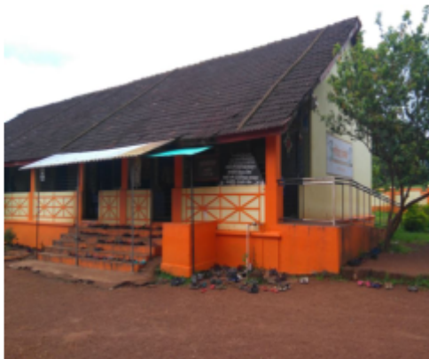
Polling Station Building Front View