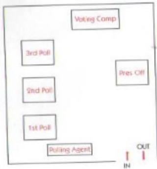
Seating Arrangement at the polling station