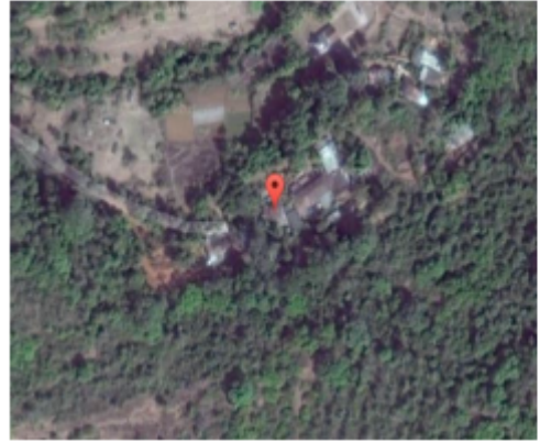
Google Map View