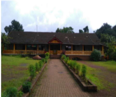
Polling Station Building Front View